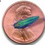
emerald ash borer (scale)

You may have heard of some of the notorious invasive species in the United States like the gypsy moth, buckthorn, red imported fire ant and the emerald ash borer. Invasive species have become a very common occurrence in North America during the last 20 to 30 years. There has not been a single cause but the increase in interstate transportation and a global economy has accelerated the process. There has been a lot of effort focused on preventing invasive species but the task is so big that it is an ongoing struggle.