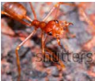
red fire ant